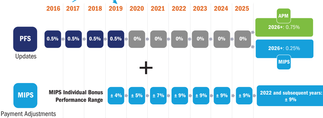
If you participate in an APM, you will receive a + payment adjustment of 5% every year, beginning in 2019.

The first payment adjustments will be based on performance year 2017 and will reflect in your 2019 Medicare payments.